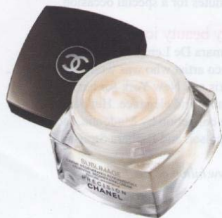
Chanel Sublimage Regenerating Cream £220