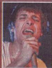
Left: Celebrities who are nominated include Gerard Butler, Sharleen Spiteri and Paul Nutini